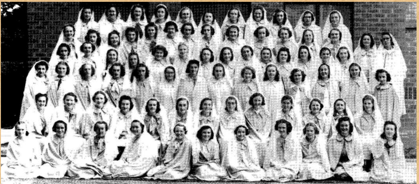
Children of Mary in regalia in St. Mary's Parish Grafton in the 1930's. (From A History of St. Mary's Parish Grafton 1862 - 1994.)